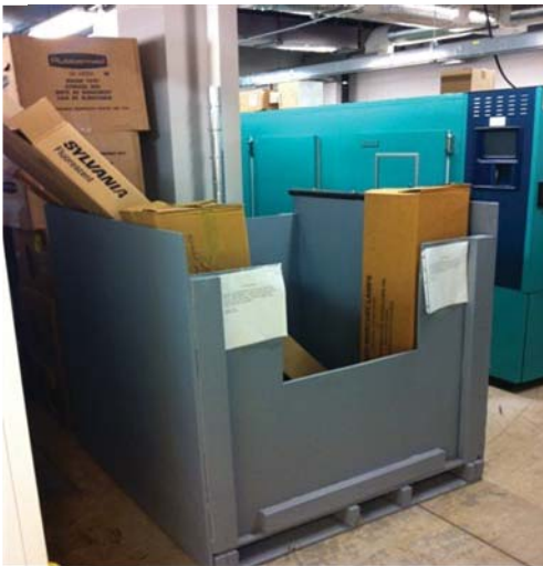
1. Take to maintenance storage area.