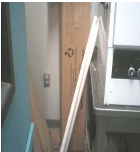
4. Do not lean bulbs or boxes against wall.