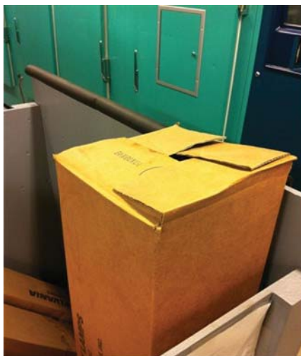
5. Keep box closed.

NOTE: EPA can fine UT $2,500 for every open box, box without a label, or each unboxed bulb.