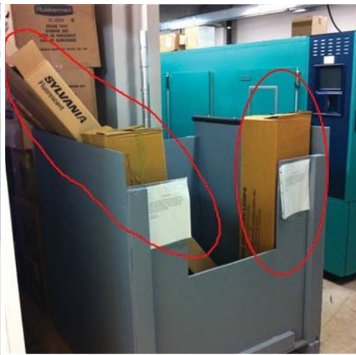
2. Place bulb in box.