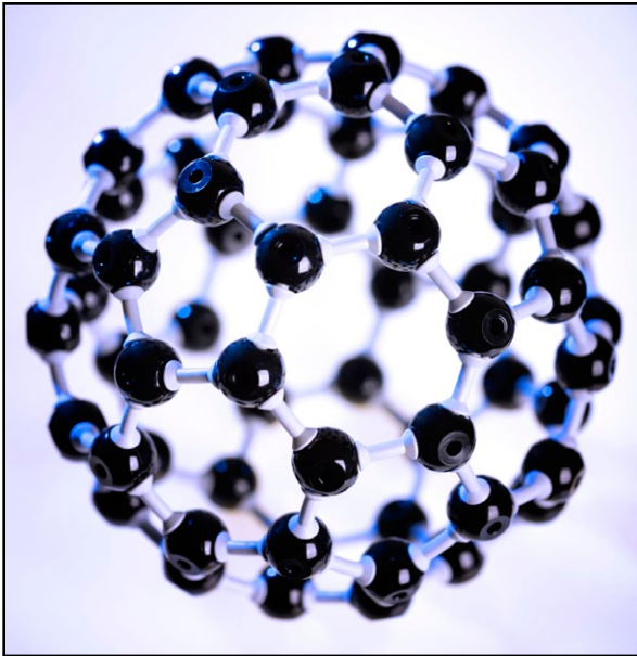
An example of a nanoparticle is a buckyball or fullerene.